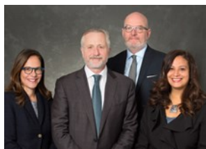
The EM Equity Investment Team